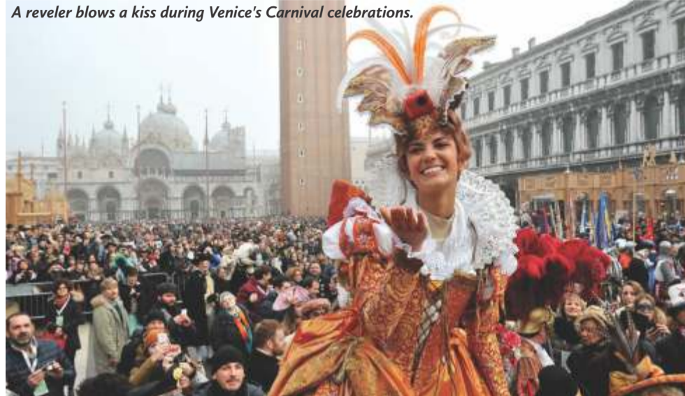
A reveler blows a kiss during Venice's Carnival celebrations.

own strong and independent identity over the centuries, fostering cultural exchanges and influencing the surrounding society."