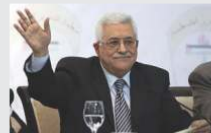
PA Chairman Mahmoud Abbas

Western governments continue mass aid for PA after it promised to stop paying jailed terrorists' salaries, but new report exposes the lie.