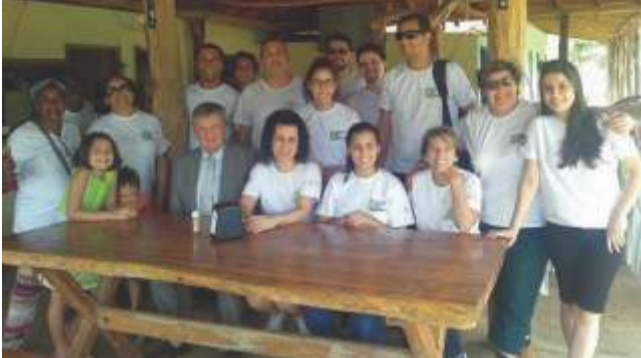
Christians for Israel Brazil Training @ Susie Valadao Mission Training Center-Itanhomi-MG

Christians for Israel International has established an affiliate in Brazil.