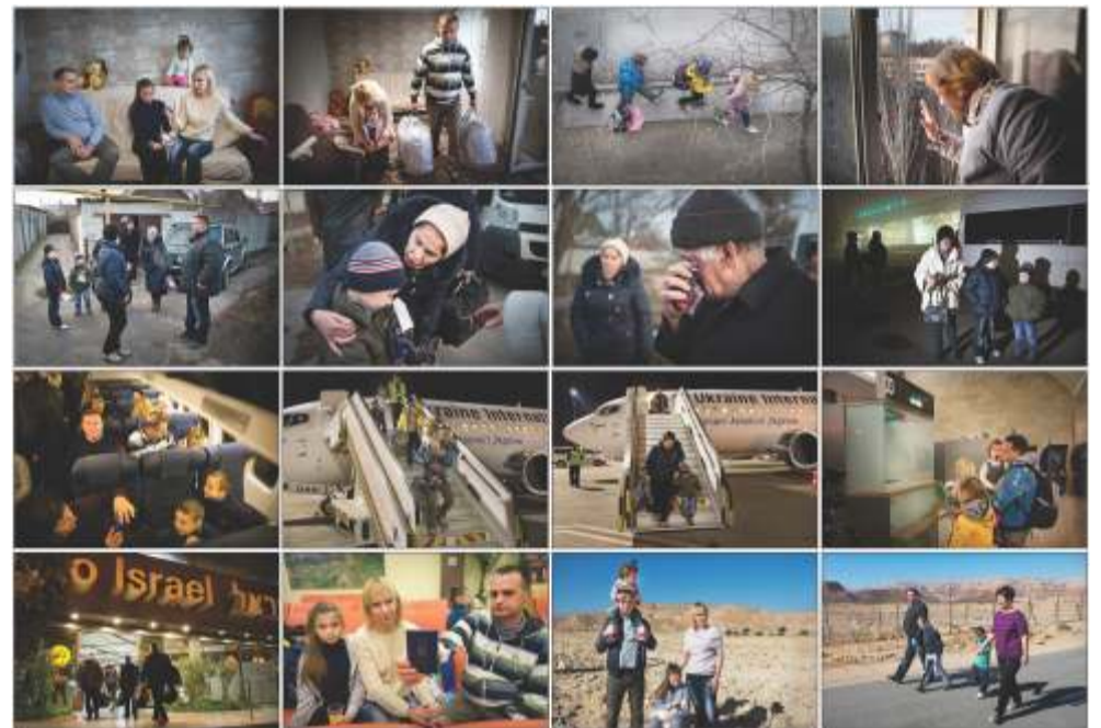
The collage above is a beautiful compilation of the Aliyah journey of two families as seen through the eyes of photographer, Henk Visscher.