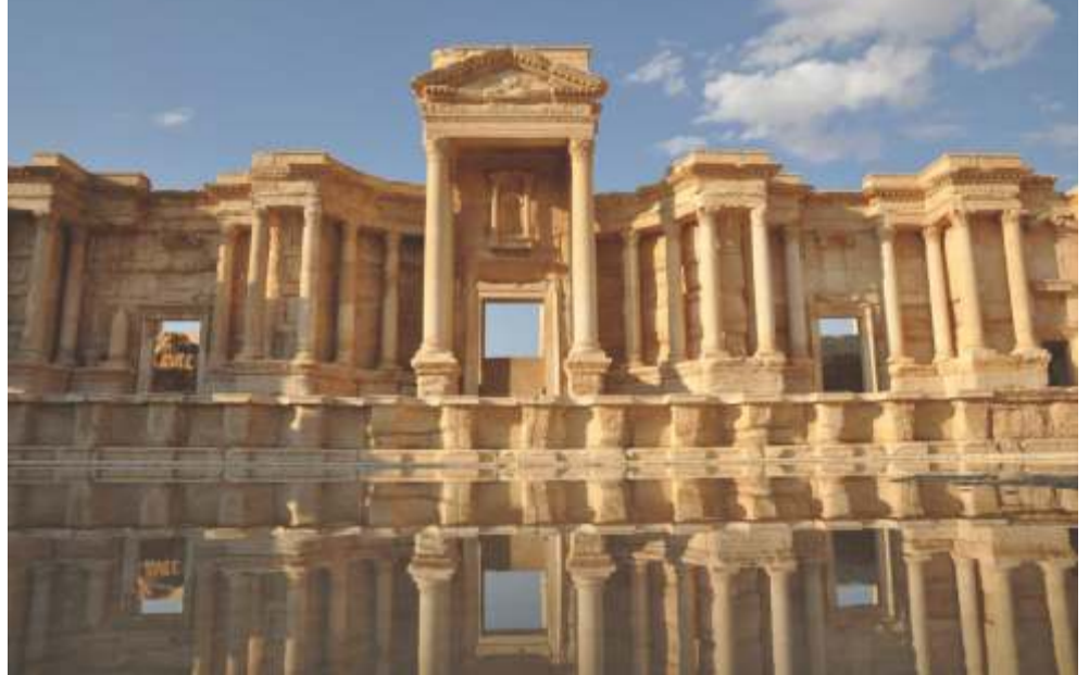
Ancient city of Palmyra

temple in Jerusalem and that Jews have no history in the land of Israel. No Palestinian leader has ever disagreed with him. Rather, the PLO has a long, unbroken record of committing war crimes no different from ISIS's in deliberately destroying Jewish antiquities, starting with the Temple Mount, which, since the PA was established in 1994 has been the focus of sustained campaign of destruction ordered by PA leaders and conducted by Palestinians.