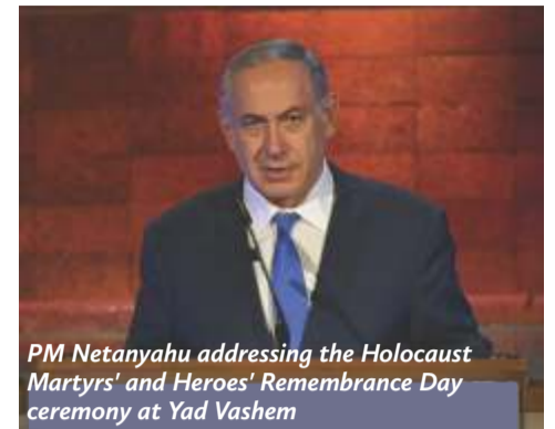
PM Netanyahu addressing the Holocaust Martyrs' and Heroes' Remembrance Day ceremony at Yad Vashem

The IDF is one of the strongest armies in the world, not only because of the tanks, planes, submarines and cyber, but largely because of the courage of our soldiers. Here they stand before us, and with them, standing shoulder to shoulder are all of our defense forces – the police, the Shin Bet, Mossad. They are inspired by the Jews who fought the Nazis in the allied forces, in the ghettos, the camps and the woods. We have learned the lesson. We do not ignore those who call for our destruction and