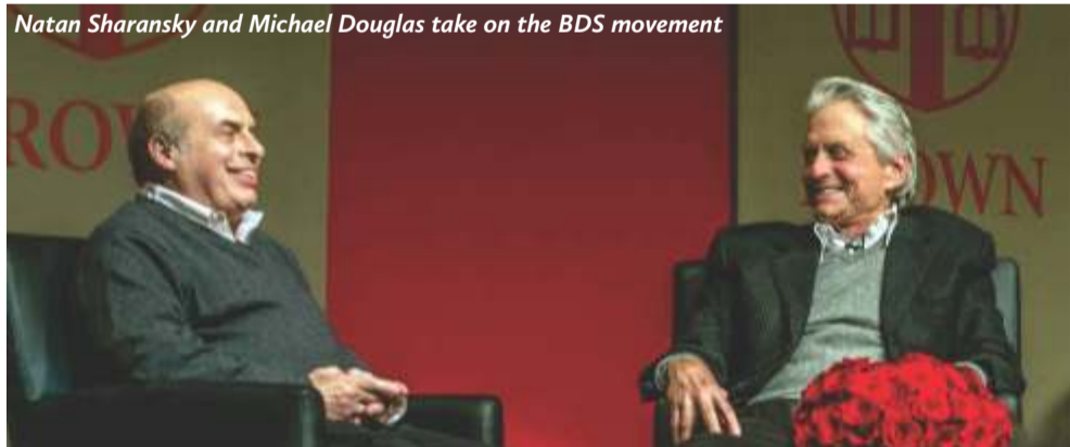
Natan Sharansky and Michael Douglas take on the BDS movement

Academy Award-winning American actor Michael Douglas and Jewish Agency Chairman Natan Sharansky teamed up to combat growing anti-Semitism and the BDS (Boycott, Divestment and Sanctions) movement on US college campuses. Douglas and Sharansky, a former Prisoner of Zion who immigrated to Israel from the Soviet Union in 1986, brought the campaign to three top institutions: Brown, Stanford and the University of California at Santa Barbara.