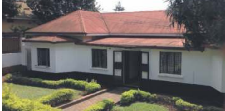
Christians for Israel Uganda office in Kampala