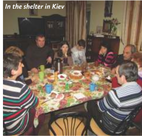
In the shelter in Kiev

Over the years, I often hear testimonies from the elderly about the Holocaust in Ukraine, and every time I shudder. That enormous suffering, which is still alive today."