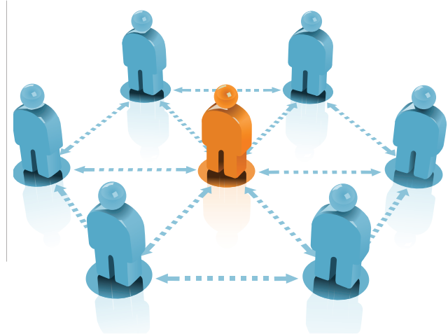
Christians for Israel International is the hub in the wheel of the global Christians for Israel movement.

To support and comfort Israel and the Jewish people in prayer and action.